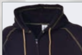
KP8017 BLACK / GOLD