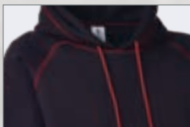
KP8011 BLACK / RED

ALSO AVAILABLE: KP8811 & KP8817 – Black with Black stitching